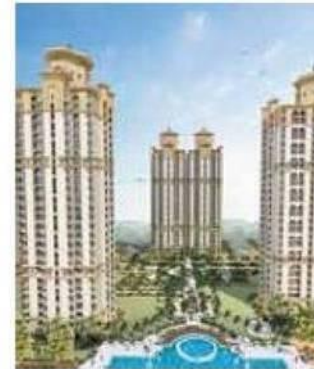
Part of Capital Greens, Premium luxury apartments