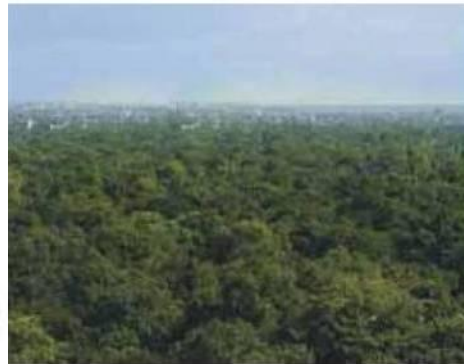
130 Acres of Permanent Green